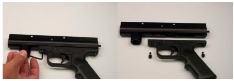
A and A1—Begin by removing the trigger assembly screws (part #55) with a 3mm Allen key on the front and rear of the trigger assembly. The bottom body half and trigger assembly will now come apart as shown on picture A1.

***NOTE: Please make sure the trigger assembly is not cocked***