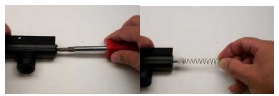
Diagram 1-4: Removing the volume chamber lug, cup seal return spring, and cup seal.

A— Begin by unscrewing the volume chamber lug (part # 41) with a flathead or '—' screwdriver.