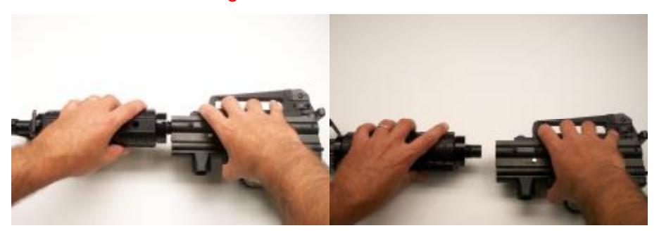
Diagram 1-8: Barrel Removal