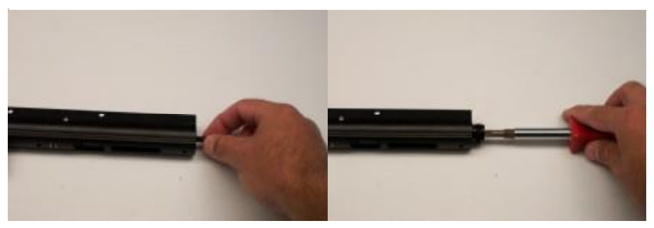
Diagram 1-3: Removing the velocity screw, velocity lug, guide pin, and velocity spring Continued.

B—Loosen and remove velocity screw (part# 27)