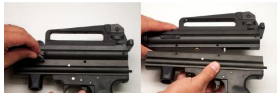
A—Squeeze gun body together and pull out the body pins (part #14) B—Pull the two body halves apart as shown in picture 'B'