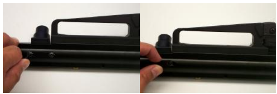
Diagram 1-6: Removing the Ball Detent.

A— Begin by removing the Ball Detent Retaining screws (part # 10 &11) B— Pull out the Ball Detent (part #9) in a upward then out motion as shown in picture 'B'