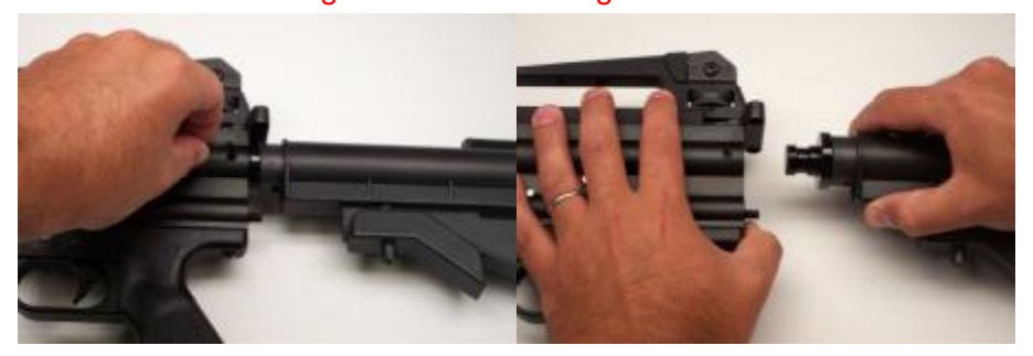
A-Loosen stock retaining screw (part #19) With a 3mm Allen Key

B—Remove stock by pulling towards the direction shown.