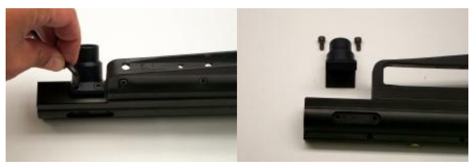
Diagram 1-7: Removing the Feed.