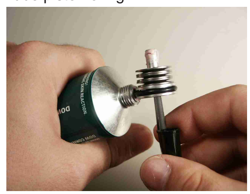
Lube piston oring.