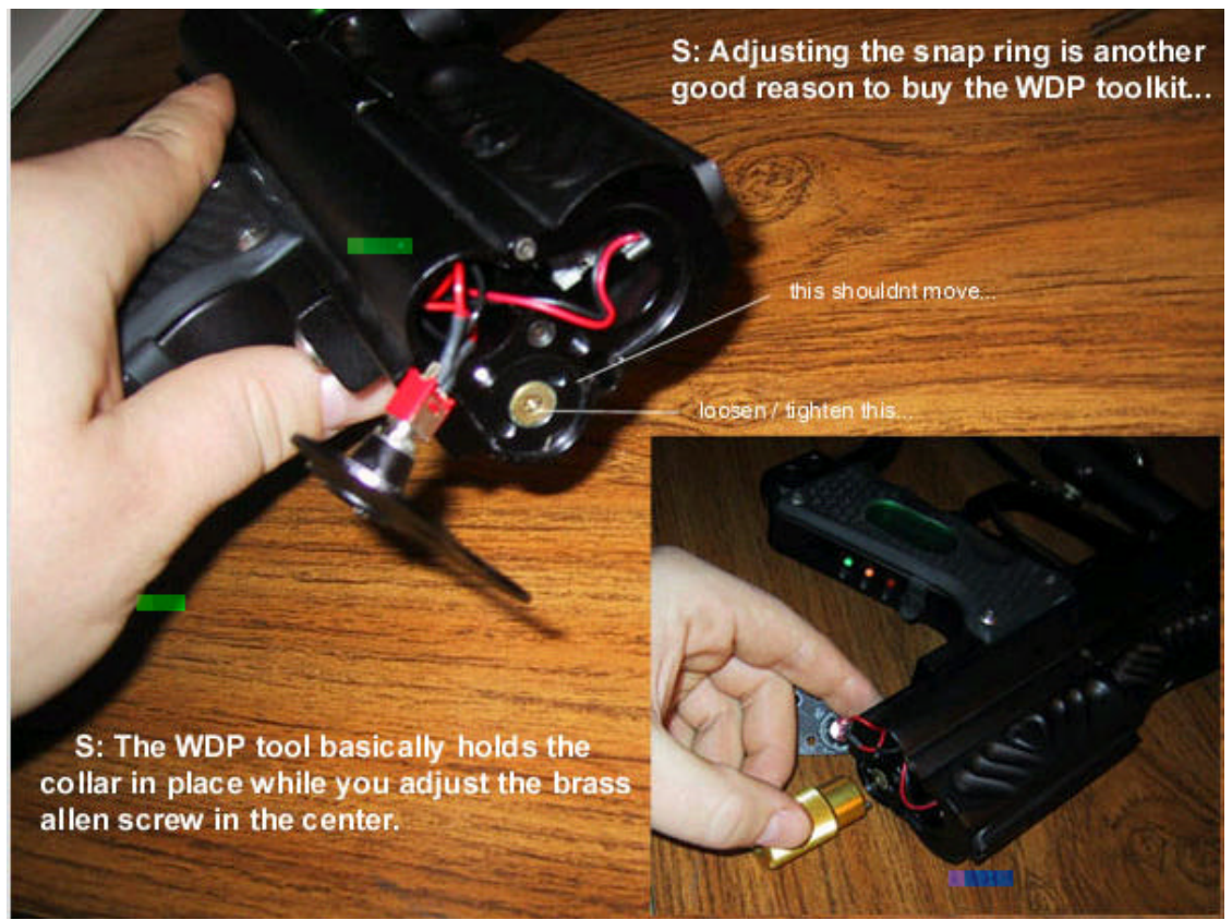
As an aside; this is one of those things that is easy to do but somewhat difficult to do well.