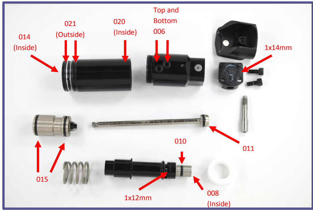
SUPERCHARGED ENGINE O-RING LOCATIONS