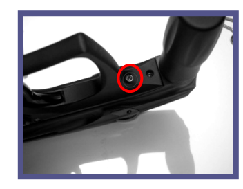
LPR adjustment screw location

After servicing the regulator you can perform an initial setting before setting pressures using the tester. Start by positioning the adjustment screw flush with the LPR Adjustment Assembly before reattaching your grip frame. This doesn't require a huge amount of force. Act like a gorilla cranking down the screws and you may warp your balls.