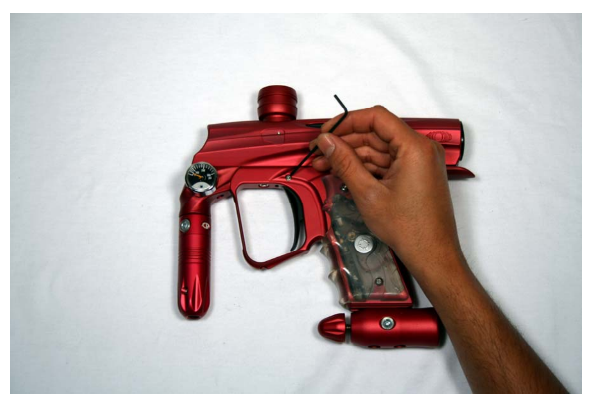
STEP 1 Using 5/64 hex Allen wrench remove trigger screw.